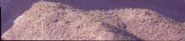
MODEL S-1000 84" x 84" x 88"