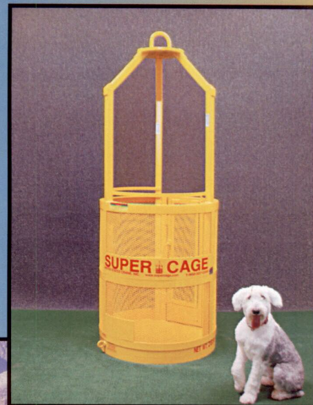
MODEL SR-7 36" O.D. x 88" Girder Dog not included