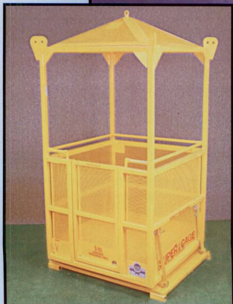
MODEL S-100 51.5" x 51.5" x 88" w/expanded metal roof and test weight