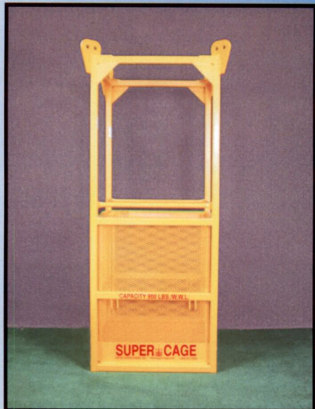
MODEL S-36 36" x 36" x 88"